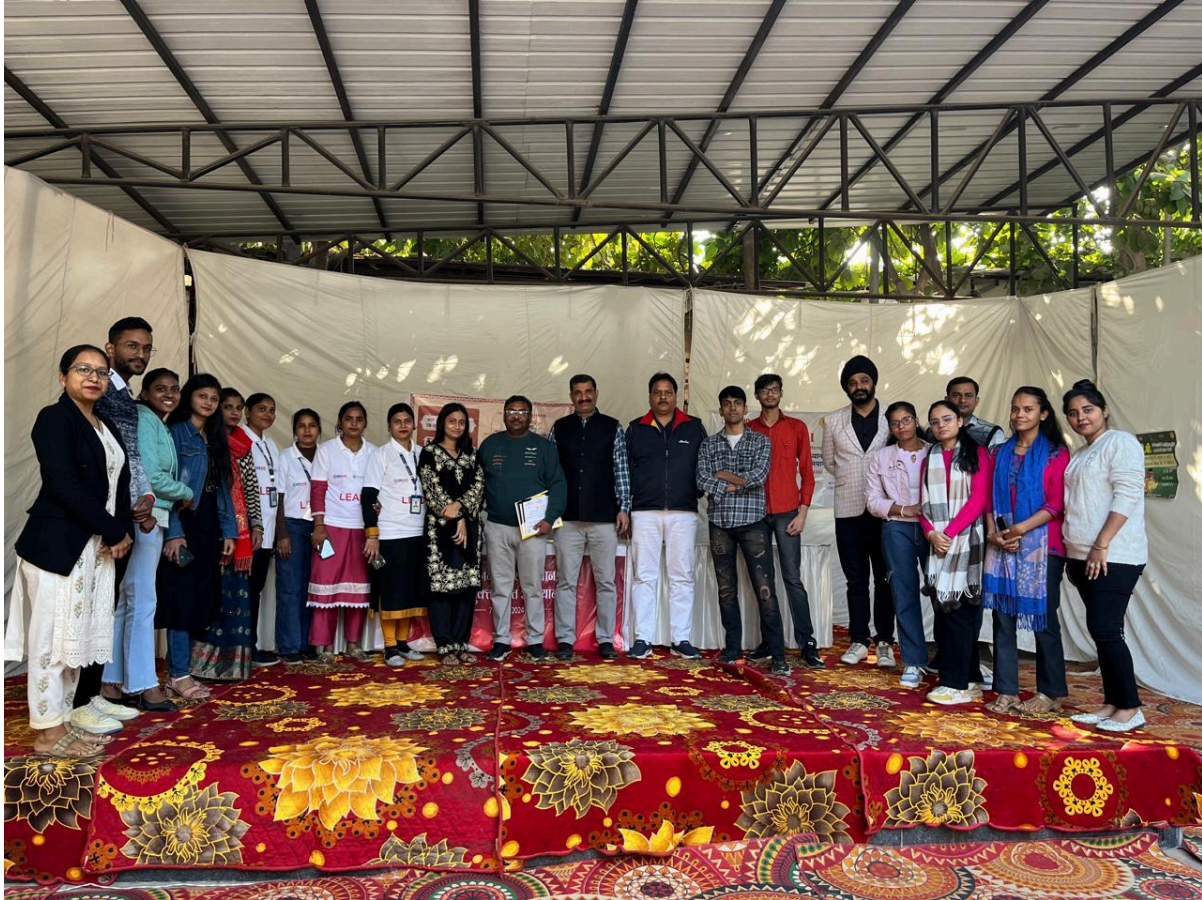
WHP field team working on TB case notification and persistent treatment marked their active participation in 100 day campaign on Active Case Finding (ACF)

WHP played a pivotal role in supporting government's 100-Day Intensified TB Elimination Campaign across the TB project intervention districts in Haryana, Punjab, Bihar, Uttar Pradesh, Himachal Pradesh, Uttarakhand and Delhi. WHP provided guidance to Senior Medical Officers and District TB Officers on the campaign's objectives, emphasizing the importance of enhancing TB detection and treatment. They actively participated in Nikshay Shivar events, conducting awareness meeting at Jan Aarogya Samiti, awareness meeting in schools observing activities such as handheld X-ray technology for TB screening, particularly benefiting rural areas by reducing patient travel and accelerating diagnosis.